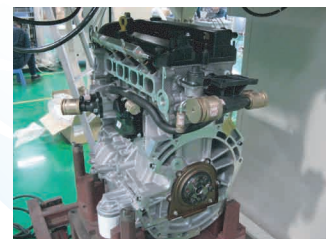
发动机总成、快速夹具 Engine assembly, quick jig