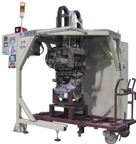
发动机总成气密测试装置 Engine assembly air leak testing device

1. 产品名称：发动机总成气密测试装置 Product Name: Engine Assembly Leak Testing Device