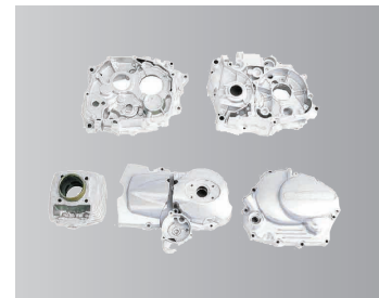
摩托车发动机壳体 Motorcycle engine housing