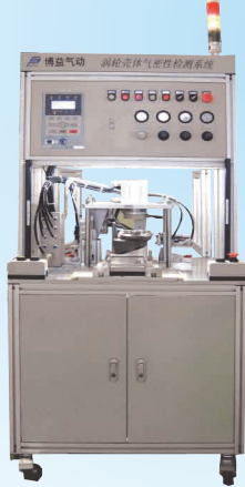
涡轮壳气密测试装置 Turbo Charger Housing leak testing device

Product Name: Turbo Charger Housing Leak Testing Device