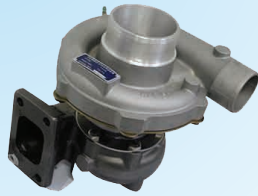
涡轮壳 Turbo Charger Housing