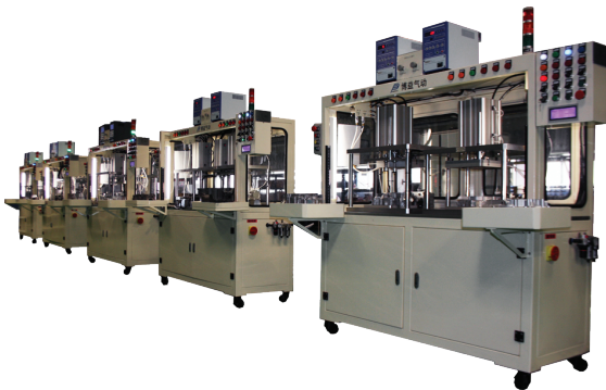
各种摩托车发动机箱体气密测试专机 Air leak testers for various motorcycle engine housing

Product Name: Motorcycle Engine Housing Leak Testing Device