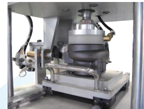
将夹具推入后进行自动封堵 After the jig is pushed in, plugging starts automatically