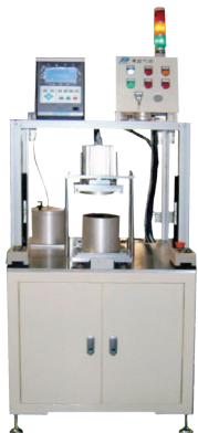
密封品通用检漏装置 Sealed product universal leak detection device