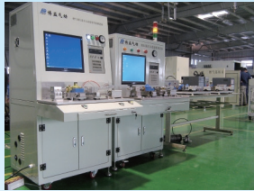
燃气调压器自动测试系统 Gas pressure regulator automatic testing system