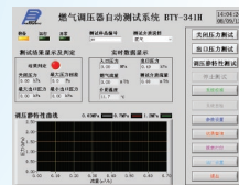
调压器软件界面 Pressure regulator software interface