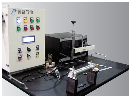
微波炉门耐久试验台 Microwave oven door durability test bed

2. 用途：用于阀门、调温器、开关、门等活动部位耐久性试验。 Application: Durability tests for non-fixed parts such as valves, thermolators, switches and doors