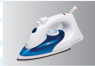
电熨斗 Electric iron

4. 核心器件：FL-295CUL型气密检漏仪 Main Instruments: FL-295CUL Air Leak Tester