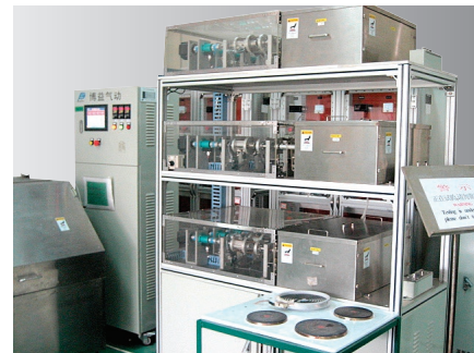
旋塞阀门温度寿命测试台 Stopcock valve temperature and life test bed

3. 主要功能和特点： Functions and Specifications ● 可以任意设置循环次数1~9999999次 Cycle number 1~9999999 times, to be set at will